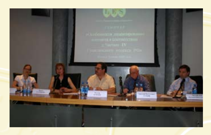
Seminar held by LES Russia in Moscow on June 5, 2008.

On June 14 in Moscow, LES Russia held a seminar "Companies' Strategies and Practices in IP Managing and Technology Licensing." 27 attendees from Russian and Ukrainian industrial companies and legal circles participated in the seminar. The main goal was to share experiences