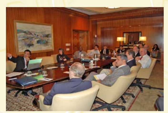
Chicago Meeting Workshop presents Life Sciences Licensing in the Middle East and Africa.

During 2007, the committee organized programs and arranged speakers for the 2007 LESI meetings in Zurich and Vancouver, and began to organize programs and arrange speakers for the 2008 meetings in Chicago and Orlando. In addition, the committee began to build on the Special Americas Program it presented in 2006 that brought Latin American industry representatives north to meet with North American industry representatives in New York. The committee worked with the leaders of the LES societies in Argentina, Brazil, Chile, and (USA & Canada) to plan a week-long sequence of conferences in Brazil, Argentina and Chile centering on the experiences of industry and university speakers from North America. The committee also helped arrange speakers for the LES Mexico and Andean Community meetings and to collect and circulate information on local programs by the national LES societies in the Americas.