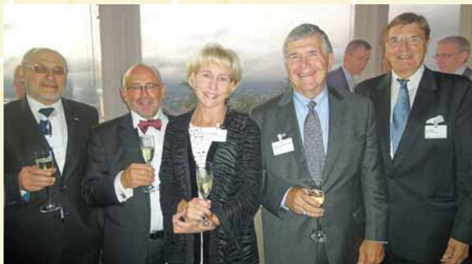
Leaders gather at the Annual Conference of 2011 for LES Scandinavia in Oslo.

Membership of LES Scandinavia remained stable during 2011 with 340 members.