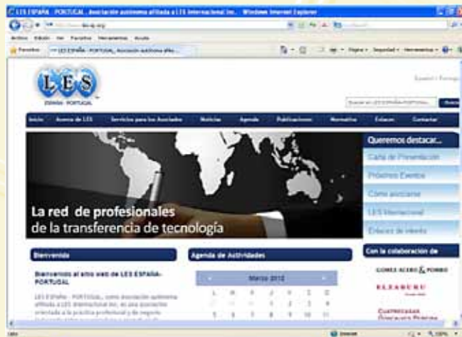
Homepage of LES Spain & Portugal’s new web site, www.les-sp.org