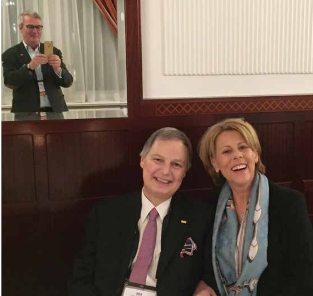
Smile! Say Cheese!