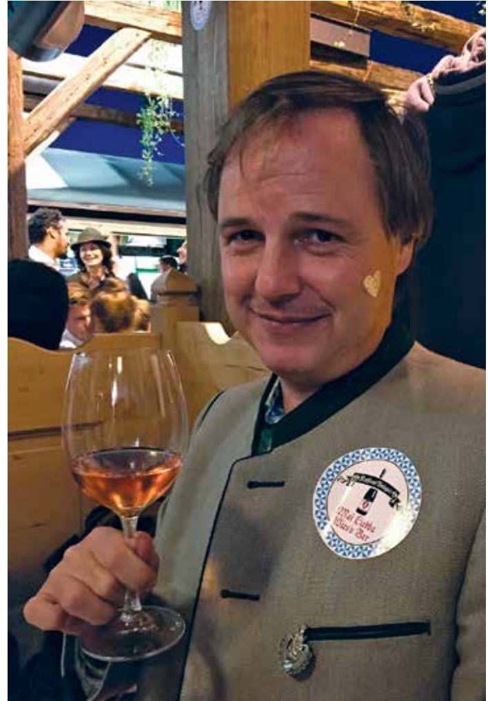
Cheers to LESI and Bardehle Pagenberg family and friends!