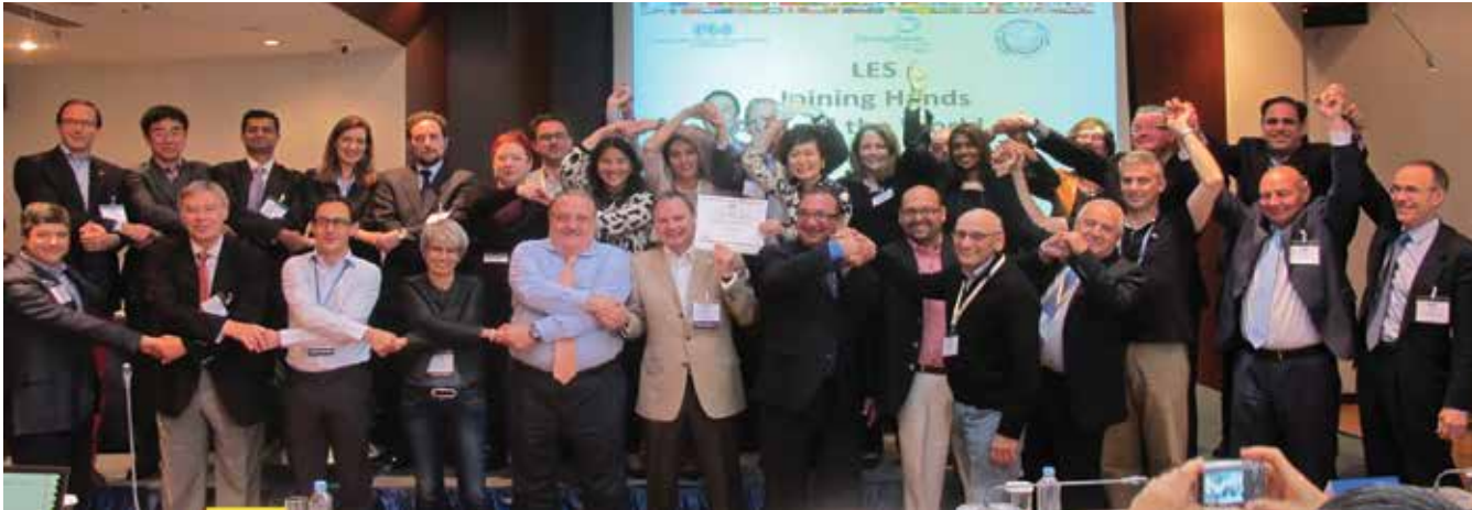
Joining Hands—a stronger LES Family and closer: participants gather at IMDM 2014 in Moscow.