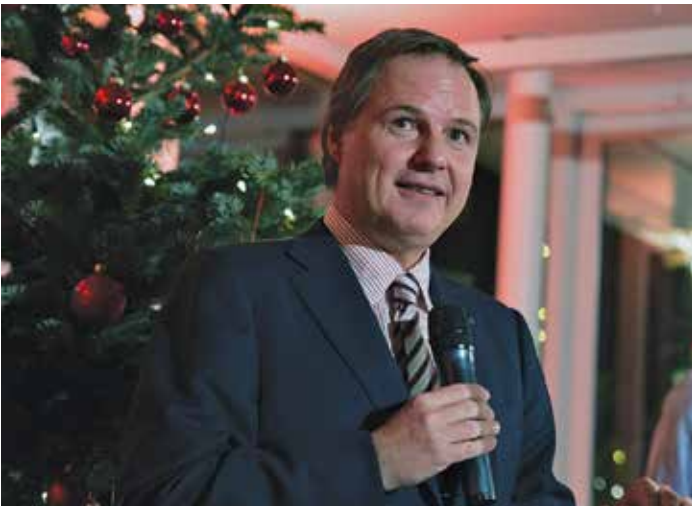
Opening Remarks at many LESI meetings.