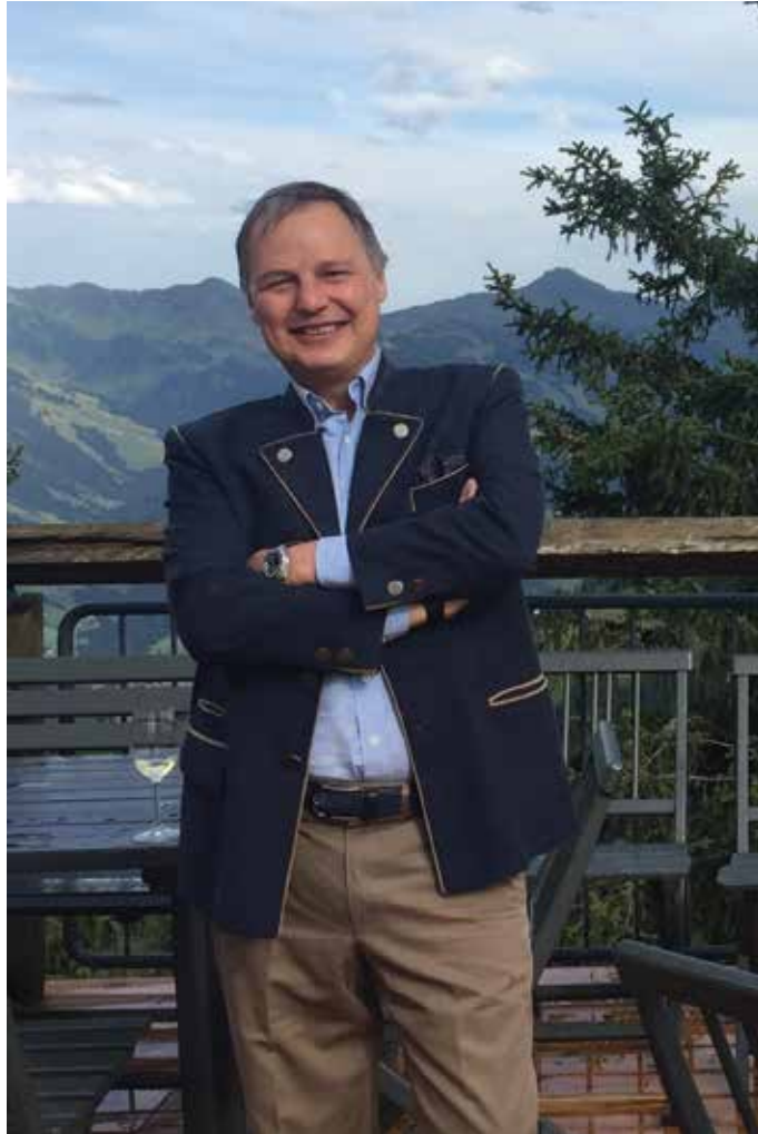
Enjoying the picturesque view.