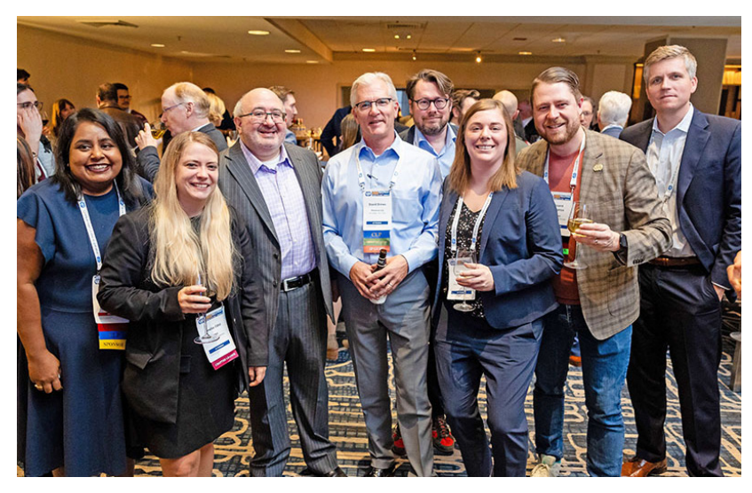
Closing reception at the meeting in Chicago.