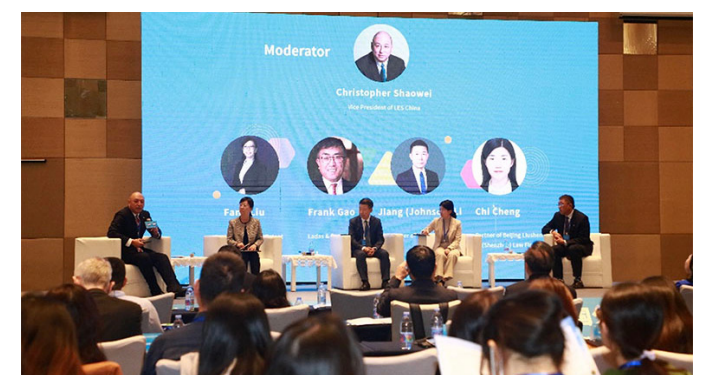
Panel Discussion 2—IP Protection and Litigation Practice.