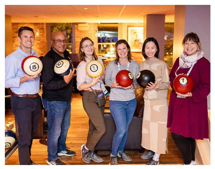
Bowling fun at Pinstripes.