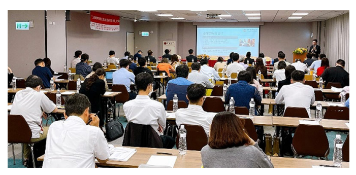
Attendees at the Corporate Fraud Response Strategies and Practicalities of Business Secret Litigation Seminar.

For high-tech companies, corporate fraud and mishandling of trade secrets can lead to significant harm and irreparable loss of competitive advantage. Having a robust response plan to investigate and address potential breaches of confidential information is crucial. On May 26, 2023, the LESCT held a seminar recognizing this issue in Hsinchu, the Silicon Valley of Taiwan. Over 80 attendees were present to learn more about legal perspectives and considerations relevant to enterprise fraud and misappropriation.