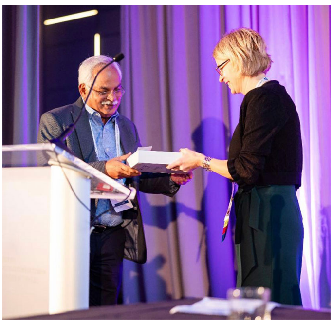
Congratulations to our iPad winner!