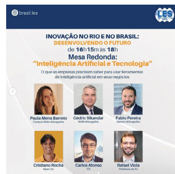
Round Table "Artificial Intelligence and Technology"