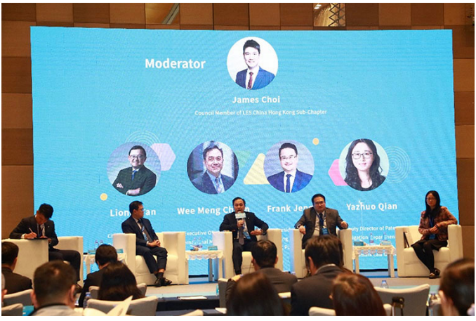
Panel Discussion 3—Impacts of New Technology on Commercialization of Ideas and Resolution of IP Disputes.