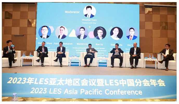
Panel Discussion 1—IP Commercial Value and Innovation.