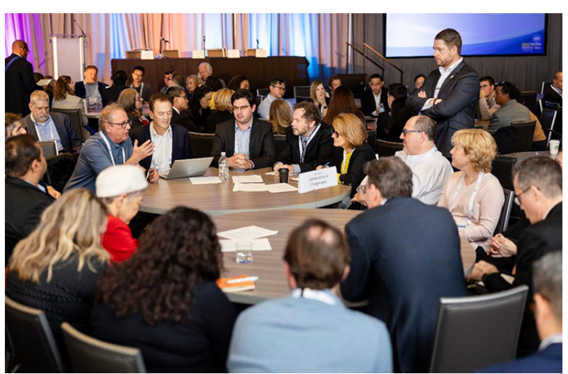
Roundtable discussions on a variety of licensing topics.