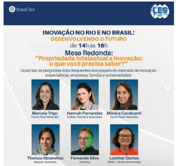
Round Table "Intellectual Property and Innovation: What Should You Know About?"