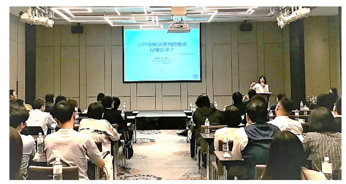
Topic: Arbitrating Patent License Dispute or Infringement? A Case Study about Choice of Dispute Resolution.

panel discussion with in-house counsel and foreign and local outside counsel ensued.