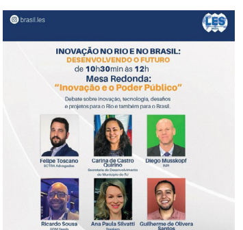
Round Table "Innovation and the Public Sector"