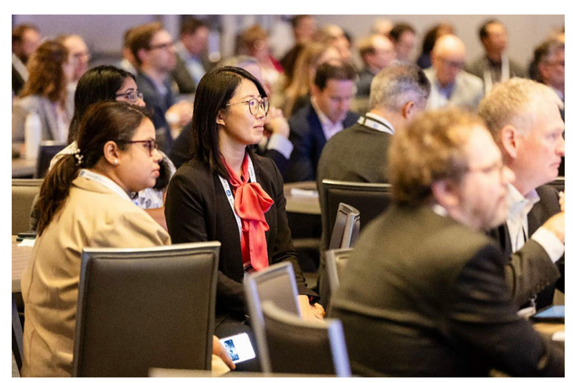
Attendees engaged at the meeting.