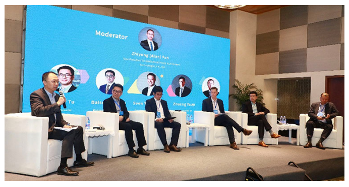
Panel Discussion 4—Value of IP Commercialization for Licensors and Licensees.