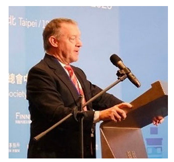
Keynote Speech: Improving the Patent System—WDTX's Role in Promoting Efficiency, Consistency, Equal Access, and Reducing Nuisance.