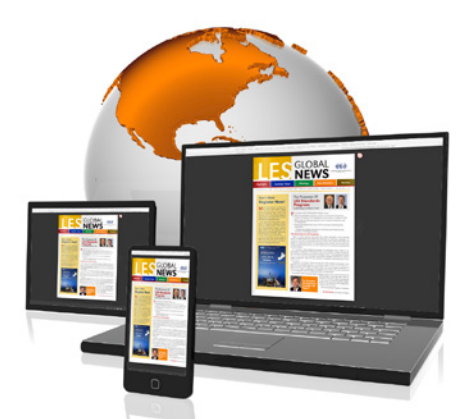
Get LES Global News Anywhere On Any Device www.lesi.org/global-news

Hotel reservations can be made directly with the China World Hotel at China World Trade Center: www.shangri-la.com/beijing/ chinaworld/.