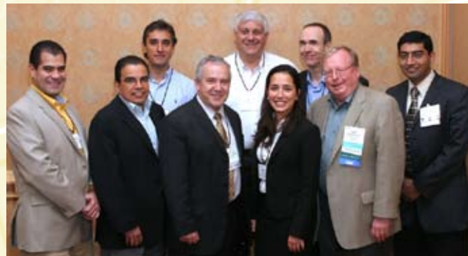
The LESI Americas IPR committee gather at the LES (USA & Canada) Annual Meeting.

The Americas Committee will continue to grow and is creating a grid of involved members to help with planning. We will schedule another tour to Brazil, Argentina and Chile to take place in 2010, a tour to Mexico and possibly the Andean Communities in 2009.