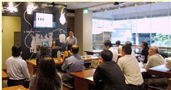
LES-SG Christmas gathering and seminar.

LES Singapore also supported the Intellectual Property Office of Singapore (IPOS) flagship public outreach initiative "IP SPECTACULAR by IPOS." This two-day community event celebrates intellectual property (IP) as an integral part of our daily lives.