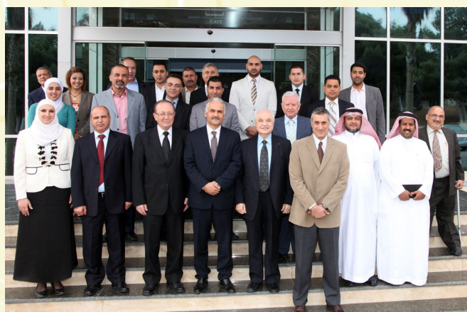
Commercialization Tour 2012, Dr. Talal Abu-Ghazaleh, LES-AC President with a group of investors and entrepreneurs in Amman, Jordan.

In addition, LES-AC participated in organizing the First Saudi IP Forum “Patents: from Idea to Commercialization” which was held in April 2012. This event was sponsored by King Abdul-Aziz City for Science and Technology (KACST), as part of the global celebrations of the World Intellectual Property Day. The Forum aimed at increasing awareness about the importance of Intellectual Property Rights (IPRs) and protection of inventions.