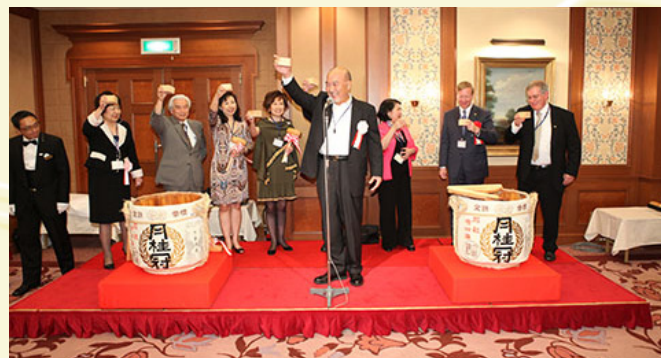
At the reception, a traditional Japanese Kagami-wari performance was performed by the President of Asia Pacific Societies & LESI Board members.