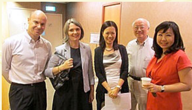
LES-SG members at the LES Seminar.