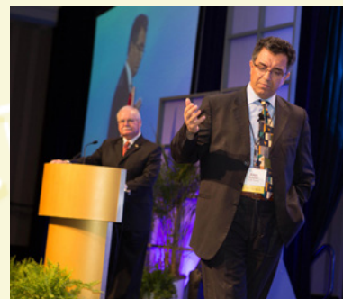
On October 14-17, 2012 LES International Delegates met at the Sheraton Centre Toronto in Ontario, Canada. Leadership from 32 national societies gathered to discuss all aspects important to the organization.