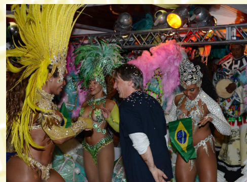
Closing reception in Rio with Samba dancers.