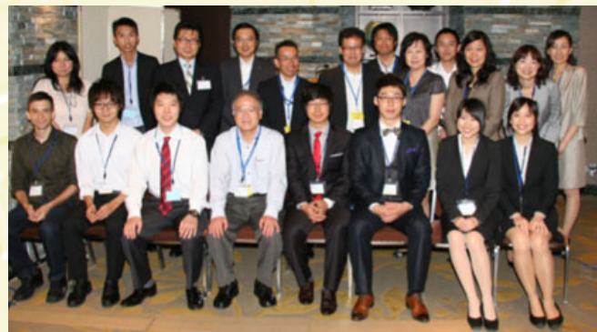
The Asia-Pacific Regional Conference 2012 winners pictured with some of the LES conference supporters.