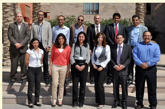
LES Arab Certified Intellectual Property Licensing Practitioner Program, Cairo 2012.

On the activities front, LES-AC organized the Arab Certified Intellectual Property Licensing Practitioner (ACIPLP) training courses in Jordan and Egypt in cooperation with the American University in Cairo during 2012. In addition, the Society held several workshops about patent drafting, patent search engines and how to use them in KSA. A special workshop for school students was held as well to introduce IPRs protection to young students.