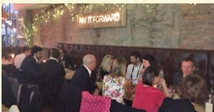
LES Scotland event at Home Restaurant in Edinburgh.