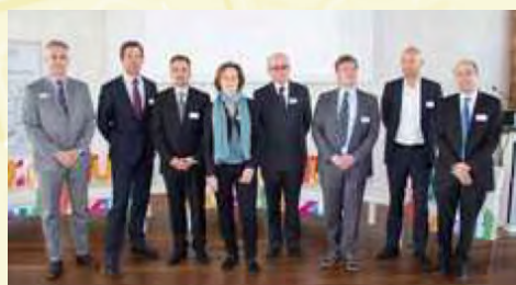
Panelists and speakers at the event "Enforcement of Patents," at Vienna University of Technology.