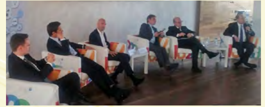
Speakers at the LES Austria World IP Day Program.