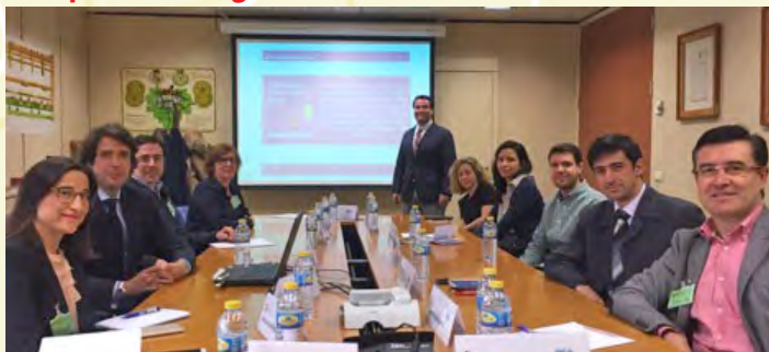
World IP Day event held in the Spanish Patents and Trademarks Office.