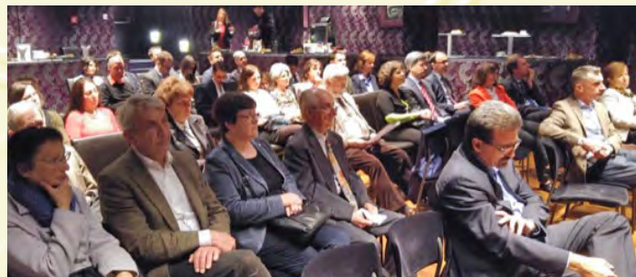
Participants attending World IP Day in Hungary.