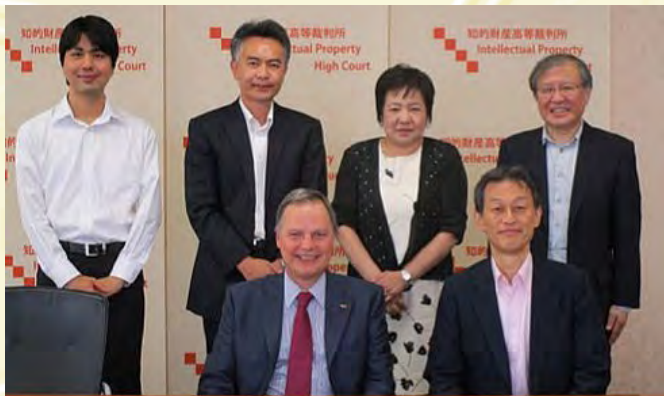
A visit with the Chief Judge of Japan IP High Court.

Nagoya and Osaka, respectively, including the courses of Licensing in pharmaceutical field, English Licensing Contract, and Licensing Negotiation, etc., with the total of 154 attendees.