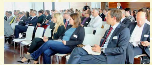
Participants listening to speakers at the event.