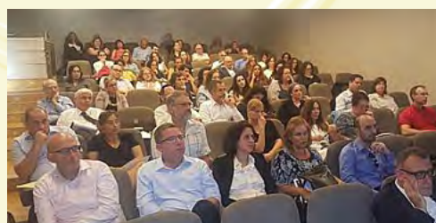
Audience at presentation.