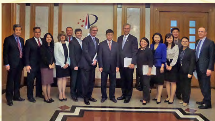
LESI International leaders at SIPO.