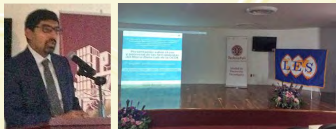
LES Mexico activities led by Hector Chagoya.