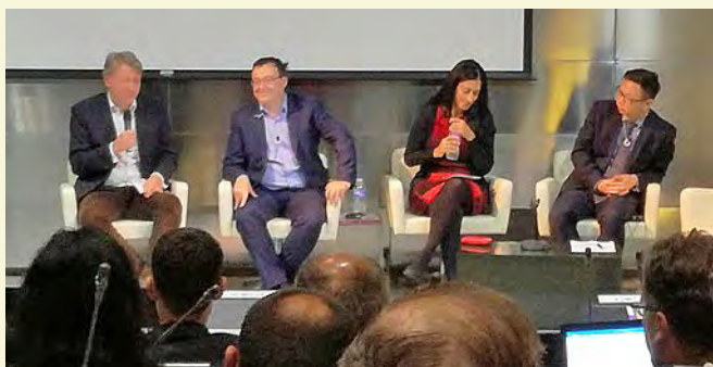
Second Discussion Panel – Industry Vision.