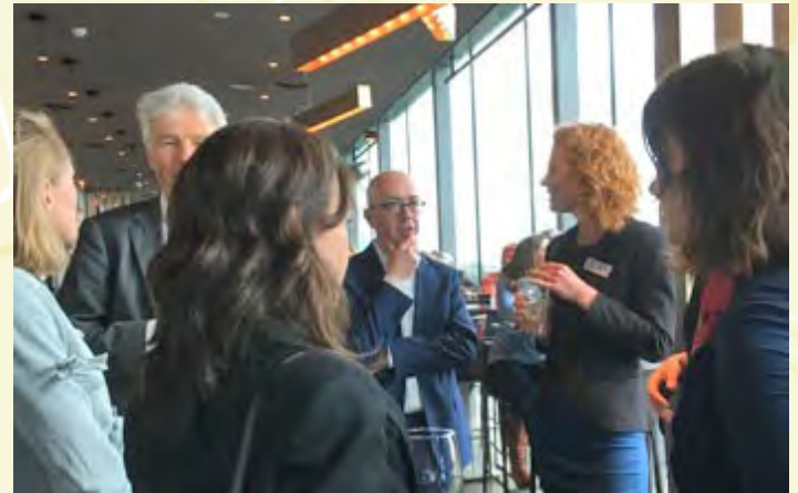
LES Benelux and AIPPI celebrate at The Skylounge.