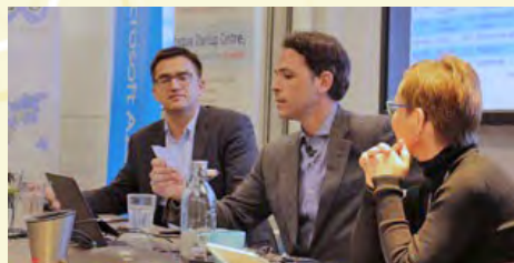
IP management was the focus of the panel discussion.