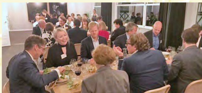
Lively discussion and delicious dinner during the evening program of the LES Scandinavia 2017 Annual conference.