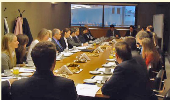
LES Argentina hosts workshop on July 6, 2010.

On April 26, we celebrated the IP day joining the "All around the world with LES" celebrations at the Museo de Arte Hispanoamericano Isaac