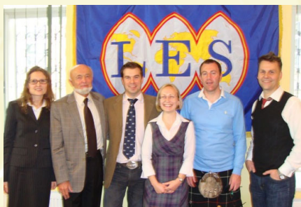
LES Czech Republic participants gather at a conference held on October 7, 2010.

LES Czech Republic hosted two successful events in 2010, including the World IP Day seminar, co-organized with the Czech Patent Office and with the Czech Inventors Society. The Society also offered the IAM 100 course, which was very well received by the audience as well as the Patent Office officials. Efforts to continue these types of cooperative programs will continue in 2011. The chapter would welcome assistance from LES International to identify experienced, qualified speakers for future events, and to present a customized version of the IAM course and licensing game activity.