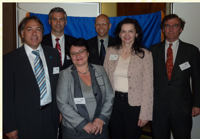
LES Austria seminar participants.

grow its membership, along with efforts to upgrade the Society's web site and continued outreach to prospective members.