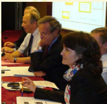
Head table at an LES France seminar.

Throughout 2010, LES France continued its successful collaboration with other organizations, including a partnership to support the CURIE (Universities TLO) Annual Congress, with several hundred participants. In addition, the chapter hosted a highly successful event on April 26, with over 80 participants, as well as the first meeting of the Young Members' Congress (YMC) France, with more than 40 attendees. Continuing these successful partnerships, including work with IP training institutes, will support the chapter's membership growth.