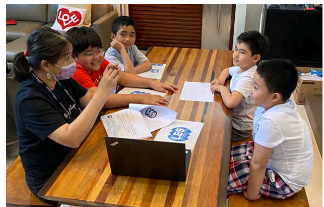
Kids learning from the LESI slide deck.