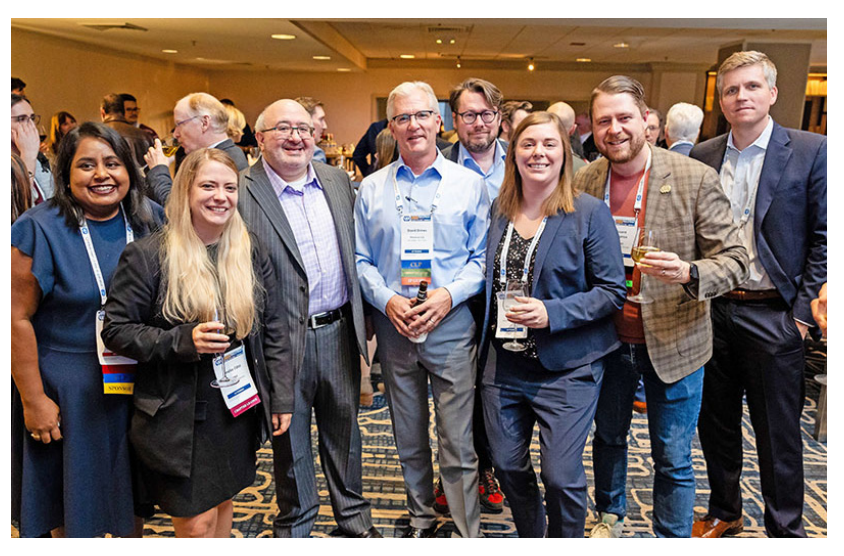
Closing reception at the meeting in Chicago.