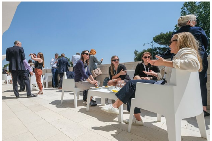
Above right: LESI Conference attendees enjoy networking and lunch in the Venetian sun.