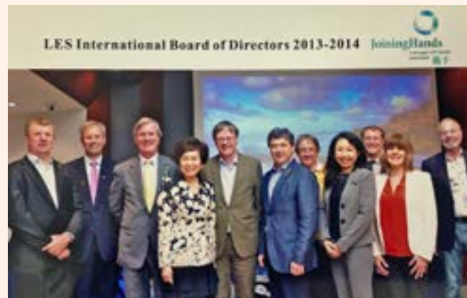
The LESI Board of Directors 2013-2014.