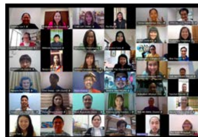
Participants of the online graduation ceremony from the Intellectual Property Program For Young Researchers in ASEAN.