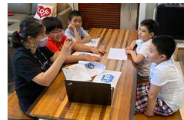
Kids learning from the LESI slide deck.