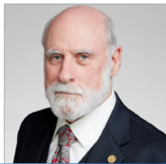
Vinton G. Cerf