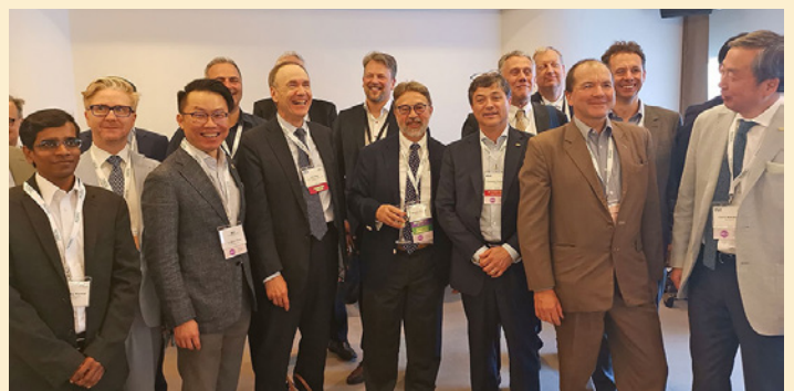
LESI leaders and attendees networking at the Yokohama meeting.