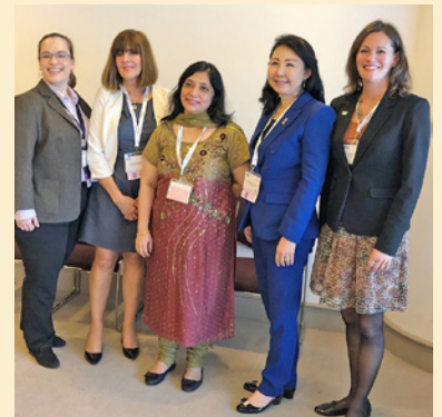
Members of the Women in Licensing Alliance Initiative (WILA).