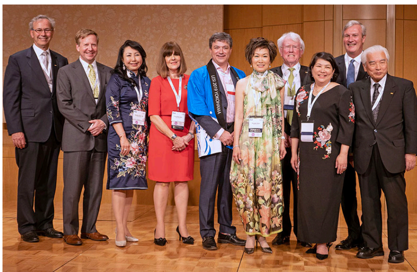
Past-Presidents at the 2019 LESI Annual Meeting in Yokohama, Japan.