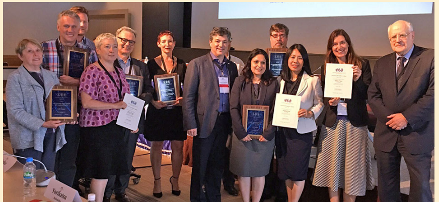
Presidential Awardees at the Annual Conference.