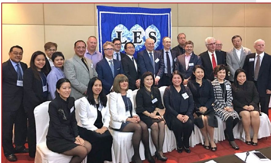
LES leaders at the Winter Meeting in Bangkok, Thailand.

We look forward to a fruitful National Leaders Meeting and Winter Planning Meeting, and to sharing the outcomes with you! ■