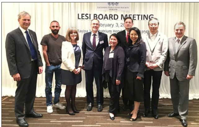
LESI Board Members