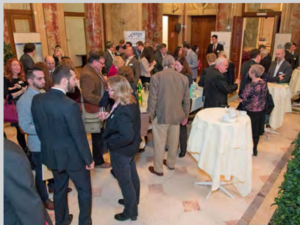
Welcome Coffee in the foyer of the House of Industry.

In addition to the Conference, the organizing team of LES Austria decided to arrange an aperitif at The Bank Brasserie & Bar of the Vienna Park Hyatt Hotel, followed by a ball evening at the traditional Vienna Coffee House Owner's Ball in the Imperial Hofburg Palace. Twenty-four participants of the Regional Conference and/or the Winter Planning Meeting attended and enjoyed the unique Viennese ball atmosphere—an unforgettable experience in particular for the attendants from overseas. ■