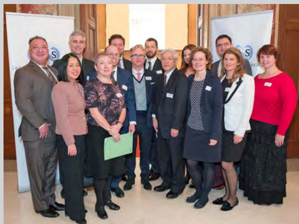
Group photo with many of the speakers.