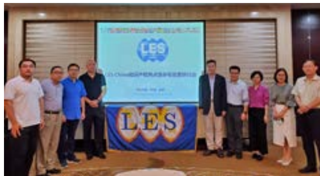
Speakers at the LES China IP commercialization seminar.