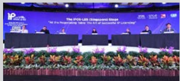
Speakers at IP Week@SG 2021 hosted by the IP Office of Singapore.