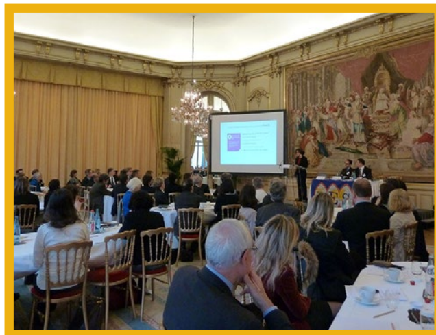
Presentations during the LES France Annual Meeting.

An unforgettable event for the luckiest who had the chance to participate, LES France welcomed the 2nd Pan-European LESI Young Members Event, gathering more than 110 participants from 14 countries. Apart from intense networking, we had excellent presentations and roundtables about various topics, such as “Boost Your Career and Become a Killer in Licensing,” “EU Directive Proposal on Know-How and Trade Secret,” “Impact of the