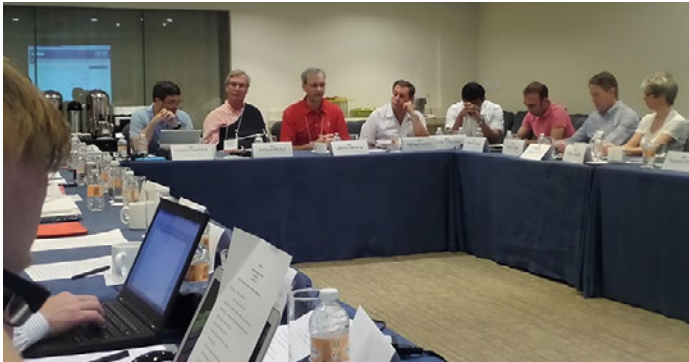
LES International Board, Past-Presidents, National Presidents and Committee Chairs meet in Cancun.

While a bright sun was warming the beaches of Cancun, Mexico on Sunday, January 25th, thirty-five members of the LESI leadership team spent the entire day in a windowless conference room working on ways to improve the LESI value proposition. The attendees included the LESI Board, several past presidents, national presidents and committee chairs. The agenda for this Winter Planning Meeting was three-fold: first, to review the various deliverables ( i.e. , a service or benefit that LESI offers to its members) that make up the LESI value proposition; second to prioritize those deliverables; and third to identify specific things we can do to improve the four deliverables of the LESI value proposition that have the highest priority.