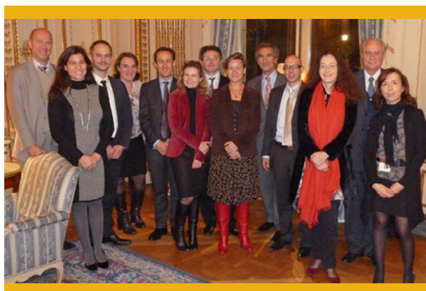
LES France 2015 Board of Directors.

Our life science group held a seminar to explore the questions of health business models at the time of the explosion of e-technologies through two main debates about “The Hospital in an E-Health Environment” and “The Industrial Partnership in E-Health.”